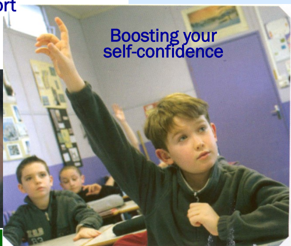
Boosting your self-confidence