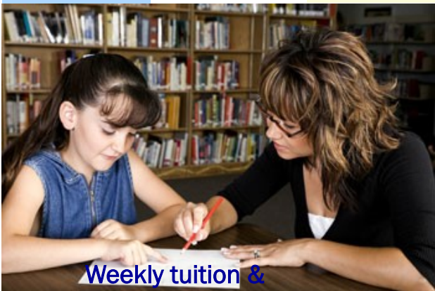
Weekly tuition & individual support

More than learning an essential foreign language, this daunting adventure becomes an enjoyable and maturing experience .